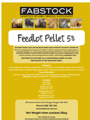
Feedlot 5% Pellet

Happy Feet is a combination of our Lactation Pasture Mix with added Zinc and Biotin. This lick has been extremely popular in the prevention of foot abscess and scald during the wetter winter months.