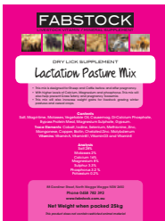
Lactation Pasture Mix